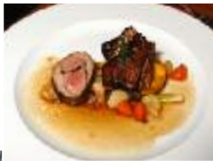
Duo of Perth County Lamb Gala auction items

The main course, a duo of Perth County lamb, reached sublime heights with 2005 Chateau des Charmes Equileus, while dessert – a heavenly chocolate-amaretti cake and pistachio gelato – paired beautifully with 2004 Peninsula Ridge Rattafia.