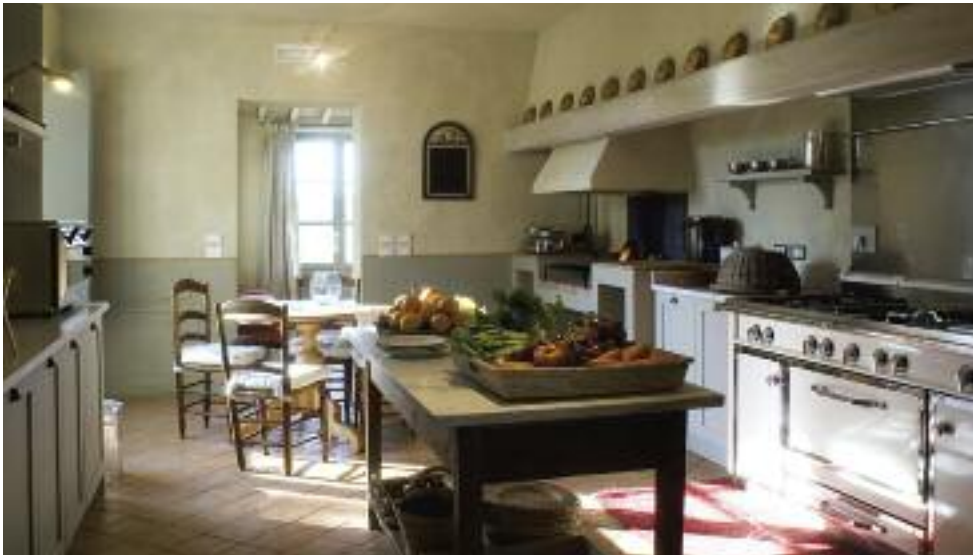
Val d'Orcia: a classic Tuscan villa

The carefully chosen 2006 Tawse Echos bistro white accompanied Bryan's first dish, a risotto with butternut squash, sage, lemon and Monforte Dairy ricotta. A salad of Chefs School smoked salmon, frisée and a warm poached egg married well with 2006 Charles Baker 'Picone Vineyard' riesling.