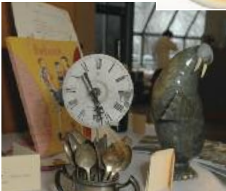
Gala

The entire evening was a triumph of celebrating good food and wine – another success for the students of the Stratford Chefs School. ■