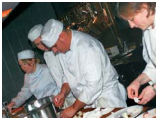
(left) Apprentices of the School

Dungeness crab and cucumber roll with a blood orange and ginger essence (pictured above), paired with a 2005 Eastman Gewürztraminer from Malivoire. This was followed by herbed crepes filled with Portobello mushrooms and sheep-milk cheese, accompanied by Malivoire's 2004 Pinot Noir Estate. The roasted boneless leg and loin of rabbit, stuffed with pistachios and pancetta, and garnished with roasted root vegetables, was expertly matched