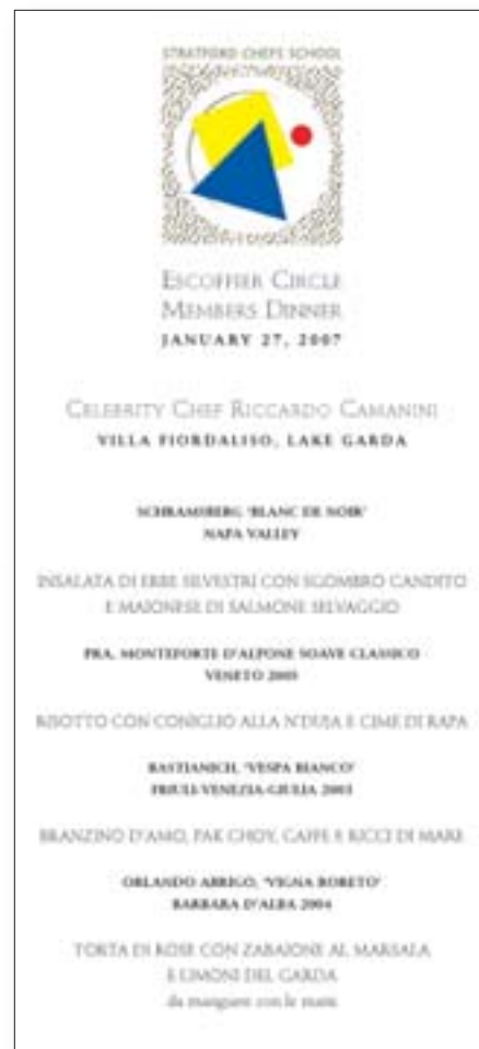
Escoffier Circle Members' Dinner Menu