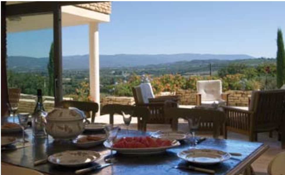
Villa in Provence

with a 2004 Baco Noir Reserve from Henry of Pelham. Dessert, a dark chocolate cream with praline, espresso granite and "Indian Summer" zabaglione, matched beautifully with Henry of Pelham's 2004 Cabernet Franc Ice Wine.